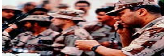
JCS Chairman Gen. Colin Powell speaks via satellite to the Pentagon troops in the Middle East.