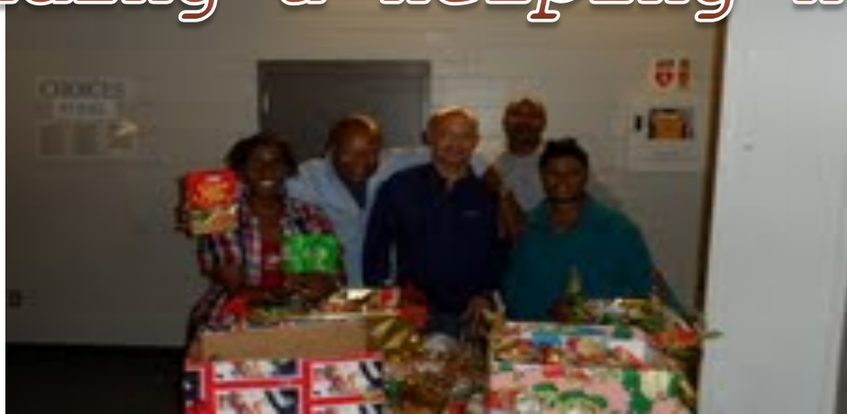
Pictured above: NNOA JAX members at DJRF

For the past 12 years NNOA has mentored young men at the Duval Juvenile Residential Facility. They provide monthly mentoring with structured fun and games. The young men also enjoy an annual trip to EverBank Field to watch the Jaguars. This past football season, NNOA and DJRF faculty members chaperoned the boys to a season matchup between Jaguars and Chicago Bears. Although the Jaguars loss, 41 to 3 was disappointing, the young men had a blast.