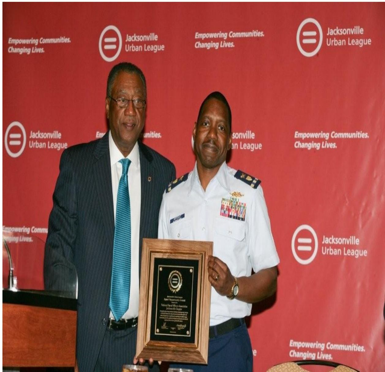
Pictured above: Jacksonville Urban League President and NNOA Jacksonville Chapter President. Chapter President accepted the Urban League Equal Opportunity Award for outstanding community involvement.