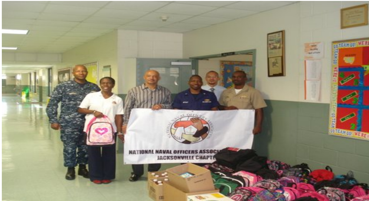
National Naval Officers Association (NNOA), Jacksonville Chapter members

Keeping its tradition of community outreach alive, NNOA was more than happy to help parents and students prepare for this school year by donating 140 backpacks filled with required school supplies. Students at Brentwood and St. Clair Evans Elementary schools were pleasantly surprised on their first day of school thanks to the effort of NNOA members and volunteers. NNOA was able to double its backpack donations from the previous school year as a result of increased fundraisers and donations.