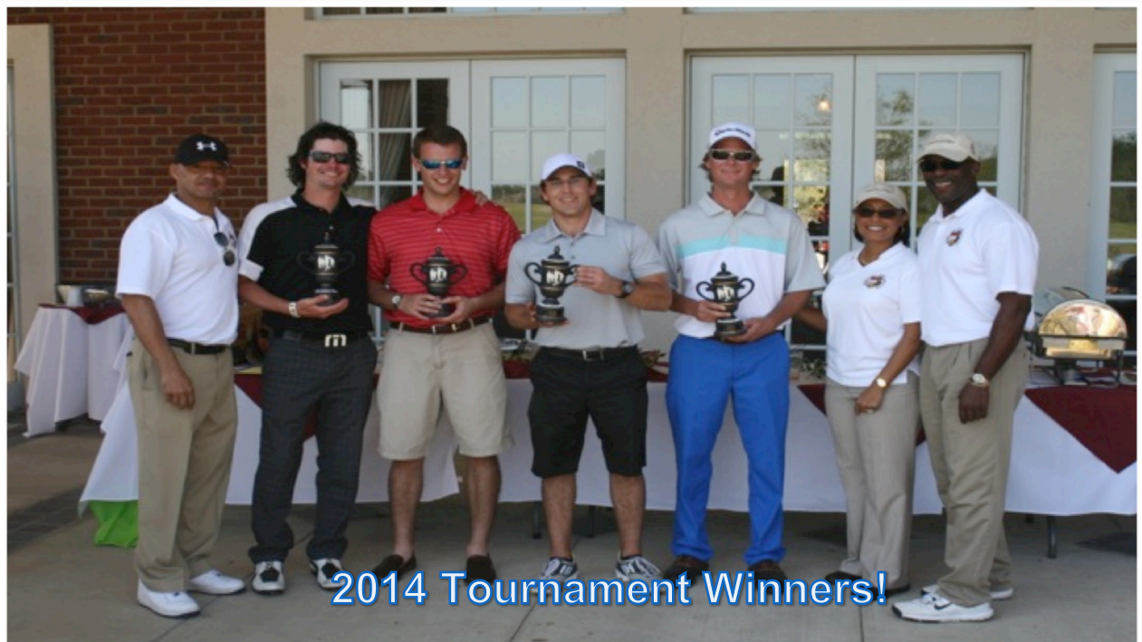
2014 Tournament Winners!