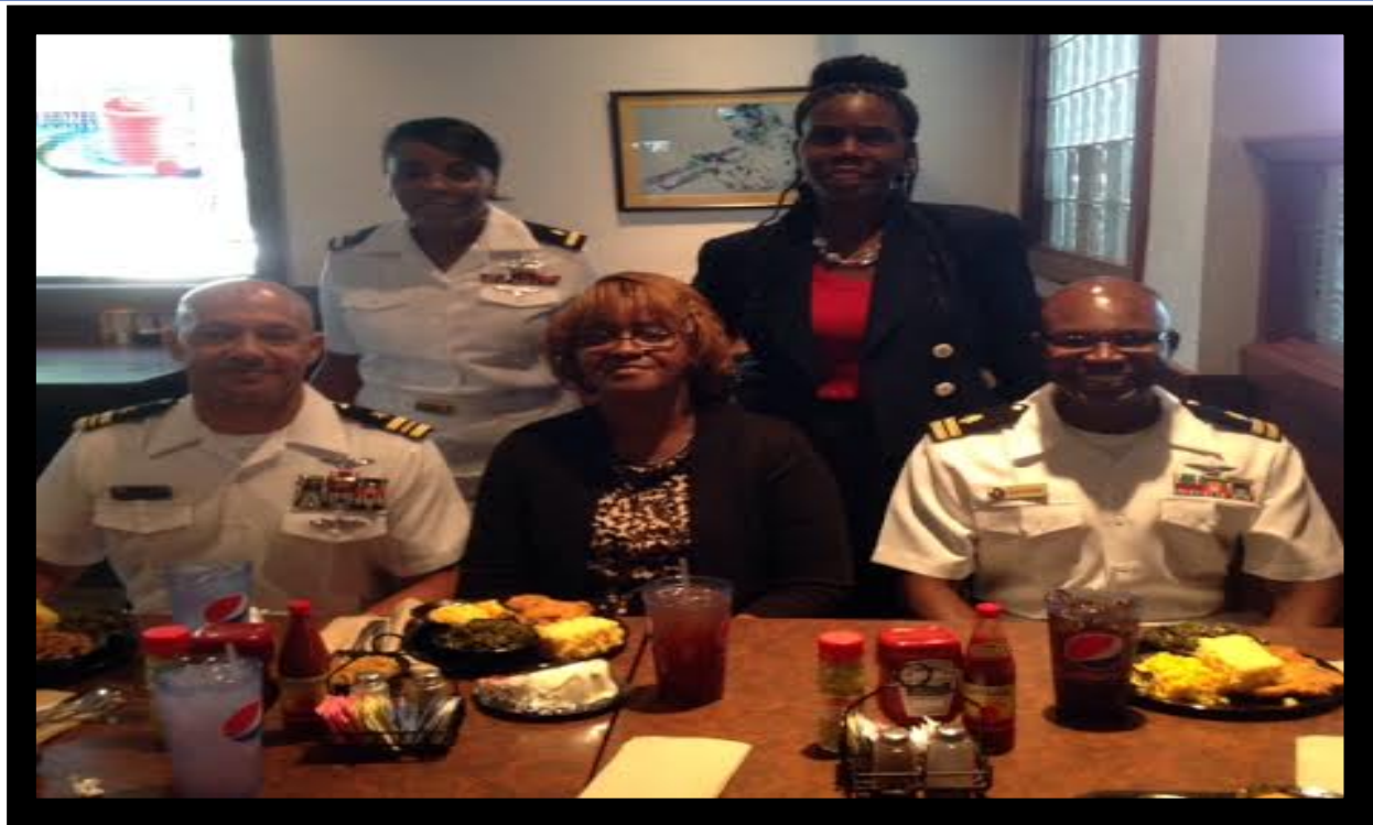
Breaking bread after church at Potters House Soul Food Bistro