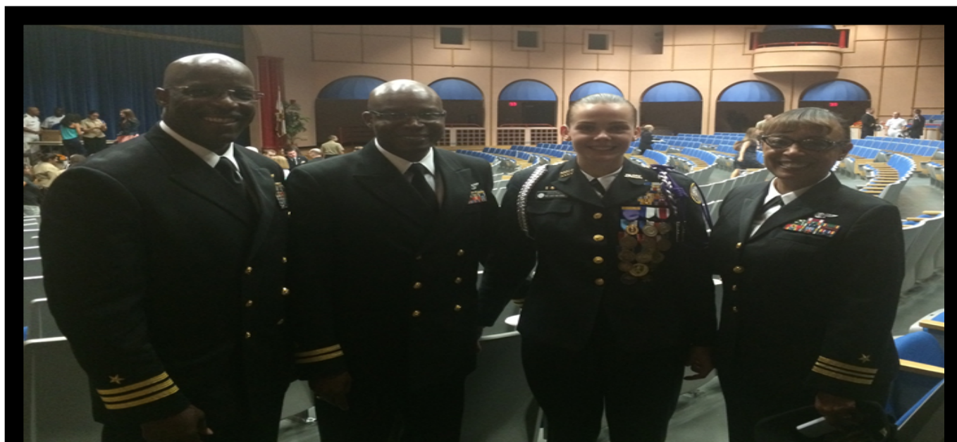
NNOA Jacksonville Chapter Members Attends First Coast High School NJROTC Awards Ceremony On 25 Apr 14